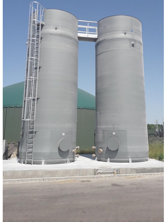
COMPOSITE STORAGE TANK FOR BIOGAZ MARKET.