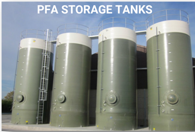
PFA STORAGE TANKS